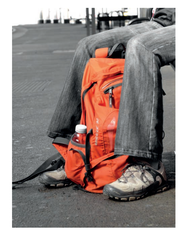
Thank you for helping to keep Kent safe. www.kent.police.uk/dontignoreitshareit